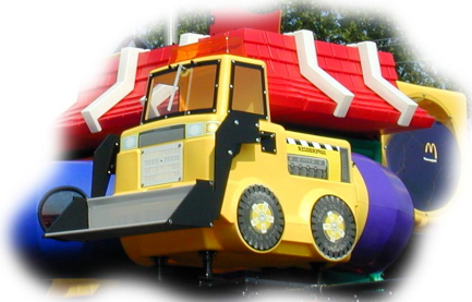
Bulldozer with hydraulic loader, one of 43 KidErgy® Interactive motion play components

With over 7,000 revenue building playparks installed to date, & approved for McDonald's worldwide, Soft Play®'s experience has created Playpark designs and patented play components exclusive to McDonald's and unique in the play industry.