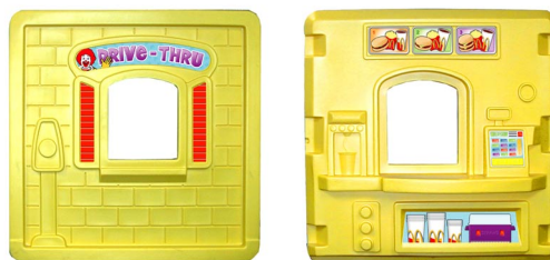
Place your order from the Race Car to the Drive-Thru play panels

To see the full catalogue on line, visit www.softplay.com/amuse