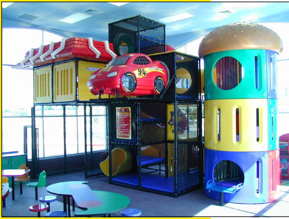
McD icons & symbols become real play components.