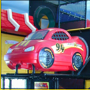
McD Race Car with Sound Effects