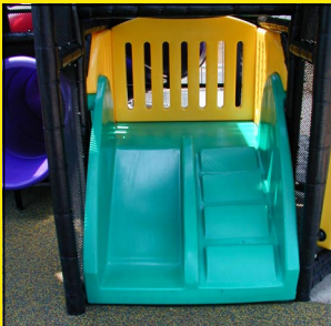
Built-In Toddler Climb & Slide