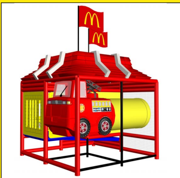
New small parks for limited spaces or to replace a BallPool!