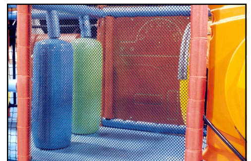
Ultra low-maintenance DuraNet® metal net & TuffSkin® plastic coated post pads now required for all corporate playparks. Both products are exclusively from Soft Play®.

Montreal based Amusement Concepts handles distribution, installation and service of Soft Play® across Canada.