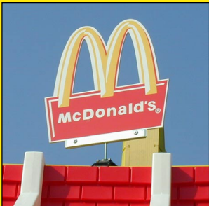
Spinning Golden Arches are kid controlled